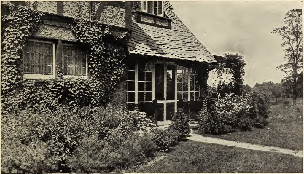
Shrubs and Vines